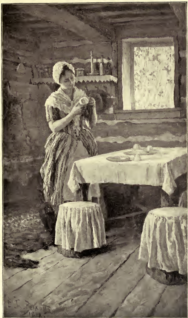
“And oh, the moment of housewifely pride!”